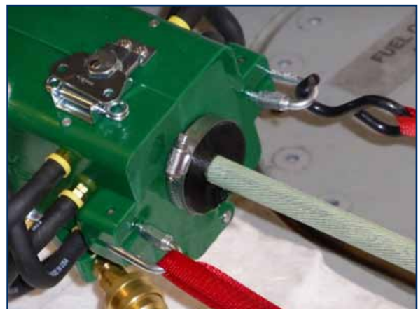
2100-BOS 41mm Cable